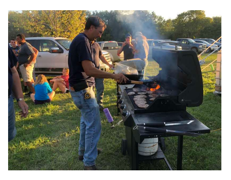
Above: Alumni BBQ-September 3