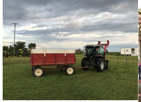
Right: Dairy Judging-September 25

Below: District Tractor Driving- September 8